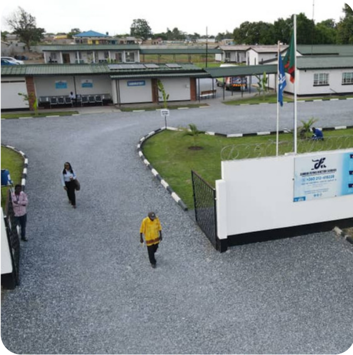
Revamped James Lawless AeroMED Centre -Northrise