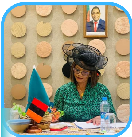
Health Minister hails ZFDS