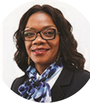
Hon. Sylvia T. Masebo