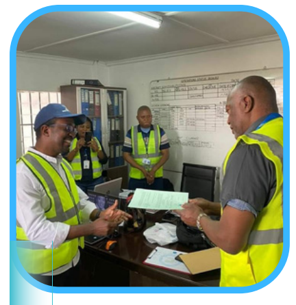
ZCAA certifies 9J- AGC ready to fly.