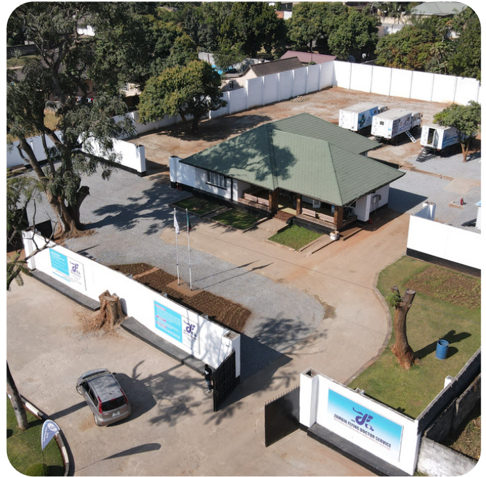
Newly Opened Kenneth Kaunda AeroMED - Itawa

The Zambia Flying Doctor Service embarked on projects to upgrade infrastructure of its two static centers in Ndola District on the Copperbelt Province namely AeroMED Kenneth Kaunda in Itawa and AeroMED James Lawless in Northrise.