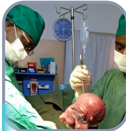
4 kg Uterine fibroid removed